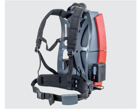
Ergonomic back frame