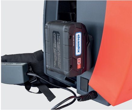
Battery holder on the side of the cleaner