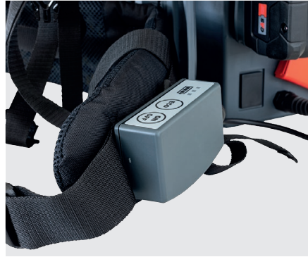
Control unit on the carrying strap