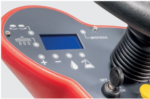
Control panel left