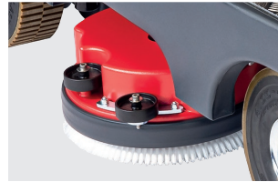
Swivelling brush head allows cleaning close to the edge