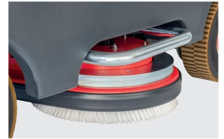
Solid protection system