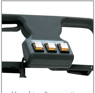
User friendly operation