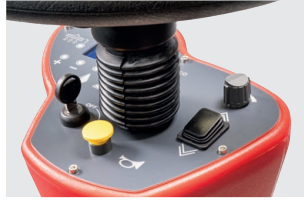
Control panel right