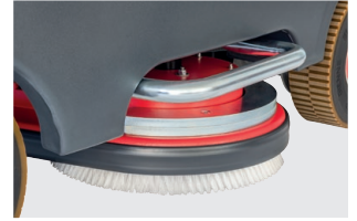
Solid protection system