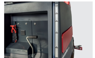
Scale for fresh water tank