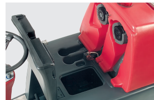
2 vacuum motors