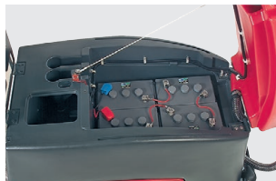
Machine open showing the batteries