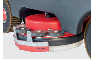
Swivelling brush head allows cleaning close to the edge