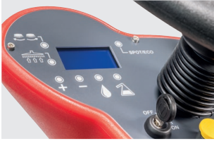
Control panel left