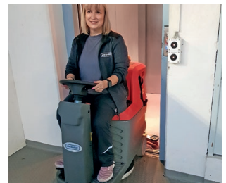
Slim design, fits into any passenger elevator