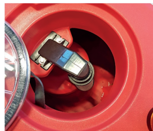
Dirty water tank, easy to clean