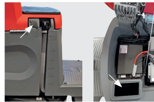
Filling opening (hose or bucket) and scale for fresh water tank