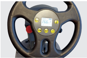
Steering wheel with integrated display