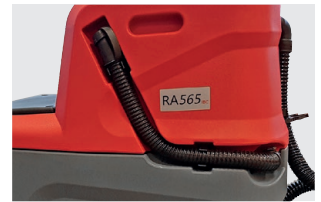
Discharge hose for dirty water