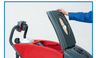
Easy to open and to clean