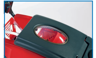
The operator can always see inside the tank