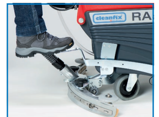
Suction unit and brush head lifting by foot