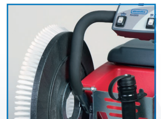
Brush holder for storage