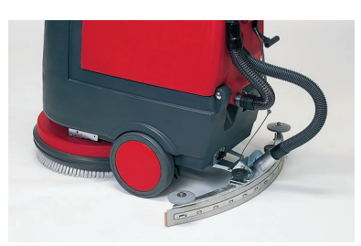
Suction nozzle curved