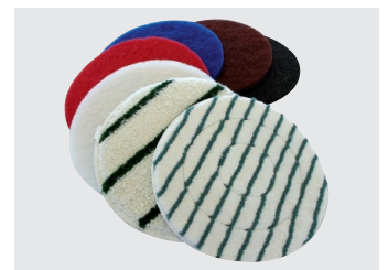
Large selection of pads