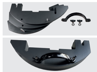
Weights easily adaptable (special accessories)