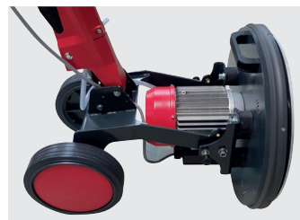
Brush head set up for optimal storage