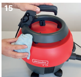
15 Clean vacuum cleaner Wipe the entire vacuum cleaner with a slightly damp cloth