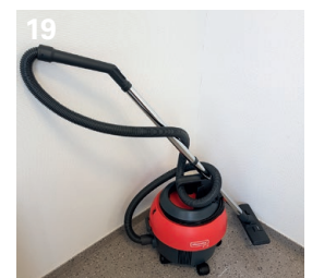
19 Storing vacuum cleaner Optionally wrap the hose around the suction tube