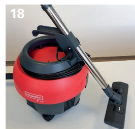
18 Suction rod inserted Only possible with the models S10 plus