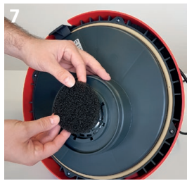
7 Check motor filter Replace it if heavily soiled