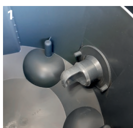
1 Clean the dust bag connection in the vacuum cleaner if necessary