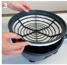
3 Lift out filter basket Replace it if heavily soiled