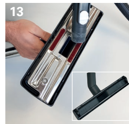
13 Clean floor nozzles After use, remove the nozzle and vacuum it