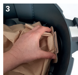
3 Plug in the dust bag tightly