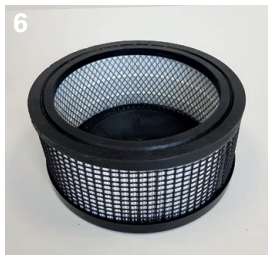
6 Optional S10 Plus: HEPA-Filter Replace it if heavily soiled