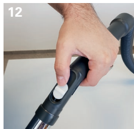
12 Missing air supply To clean soft textiles, open the air vent