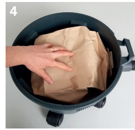
4 Check dust bag If it is full, replace it (see "Inserting the dust bag" below)