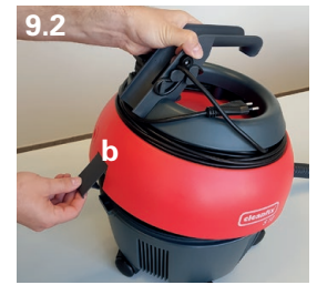
9.2 Close vacuum cleaner 2 Step 2: Press the flap (b) again