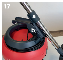
17 Insert suction rod Insert the slide clamp (a) at the handle (b) (model S10 plus)