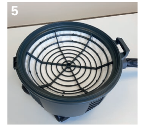
5 Insert filter basket Freely applicable, without predetermined position