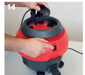
14 Switch off vacuum cleaner Press the switch and disconnect the power cord