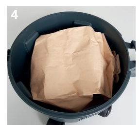
4 Make sure that the dust bag is evenly positioned