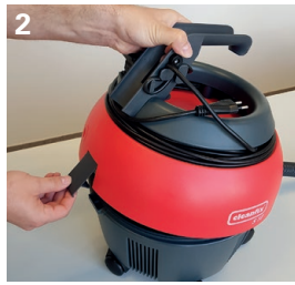
2 Open vacuum cleaner Release the black flap and lift the upper part