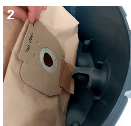
2 Insert the dust bag Observe the "Top Oben" mark on the dust bag