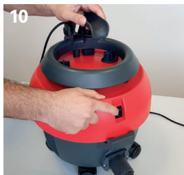
10 Switch on vacuum cleaner Connect the power cord to power and press the switch