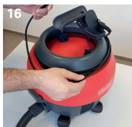
16 Winding up the cable Wind the cable tightly under the black ring