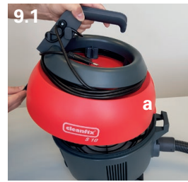
9.1 Close vacuum cleaner 1 Step 1: Guide the upper part at a slight angle into the tab (a)