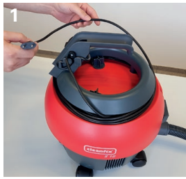
1 Unwind power cable Check the cable, replace it if damaged